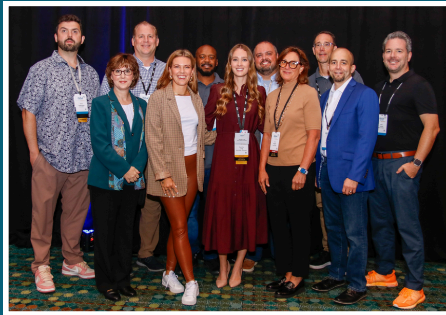
2024 Board of Directors

Thank you to our 2024 sponsors and for all who are considering sponsorship in 2025. We're looking forward to another incredible year for the chapter!