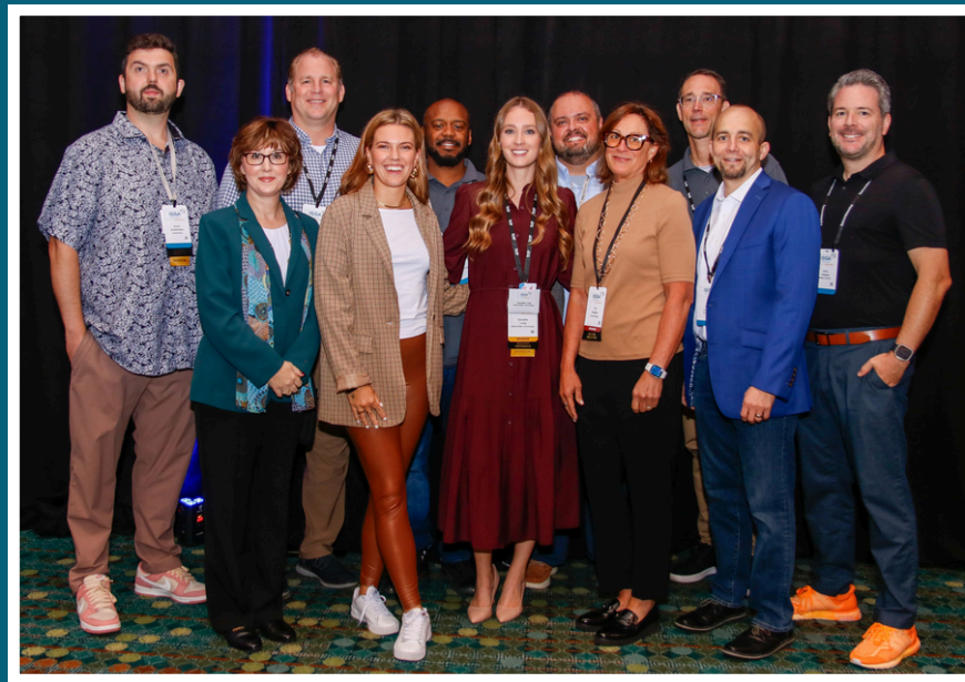
2024 Board of Directors

Thank you to our 2024 sponsors and for all who are considering sponsorship in 2025. We're looking forward to another incredible year for the chapter!